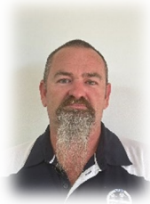
Temporary Chief Executive Officer

Governance Economic Development Special Projects Elected Member Support Marketing & Communications Recreation Services